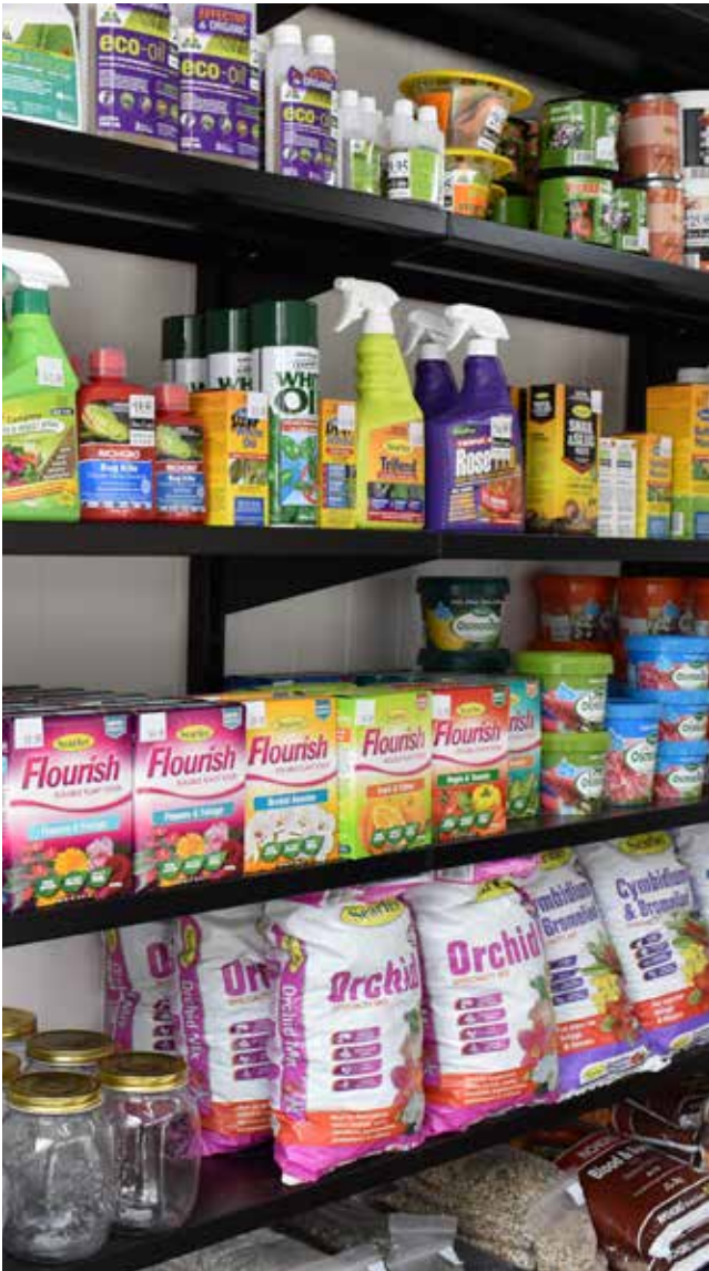
Multi-bay UniSlot™ Wallmount Wall mounted 900mm bays, 2375mm high Accessorised with black MAXe metal shelves