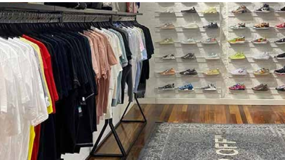
Wall Mounted Slatwall Track Wall mounted white aluminium slatwall tracks, 1200mm wide. Accessorised with acrylic shoe shelves Freestanding Clothes Racks Industrial Style Single Rail Racks