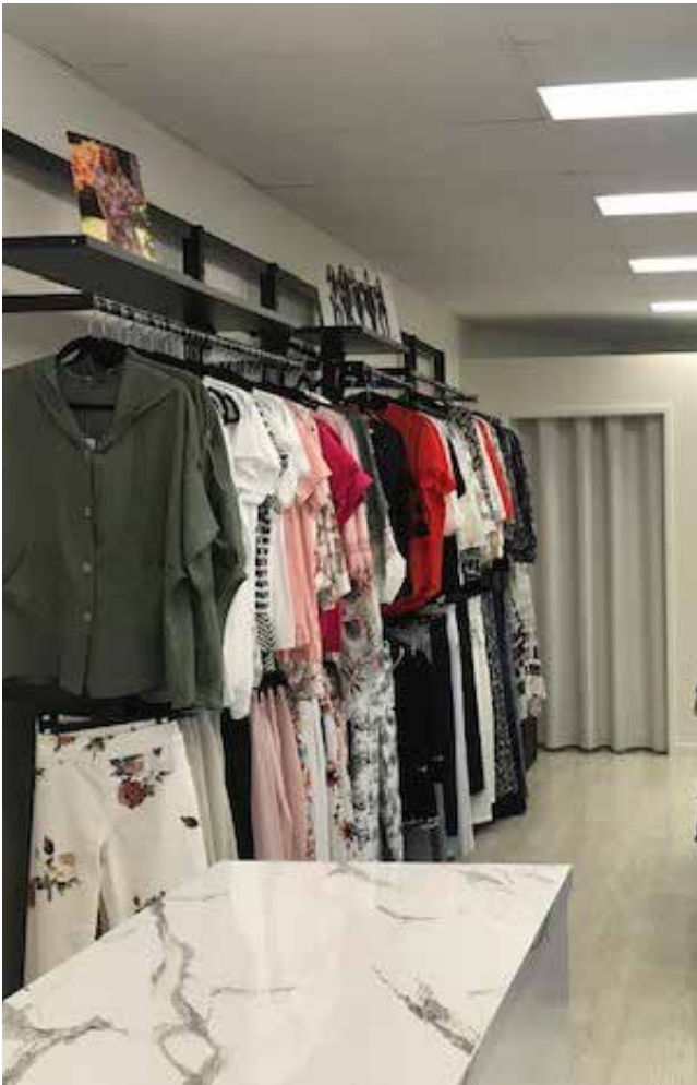
Multi-bay UniSlot™ Freestand Freestanding 600 and 1200mm bays, 2375mm high.

Accessorised with timber shelves, round hangrails, crossbars and sloping arms.