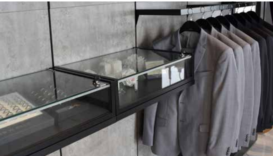
Multi-bay UniSlot™ Freestanding Freestanding 600mm bays, 2375mm high. Accessorised with concrete-look timber back panels, timber shelves, rectangular hangrails and stepped arms. Customised counter 1800mm wide black timber counter with concrete-look front Countertop Showcases and Male Fabric Torso on Timber Tripod Base