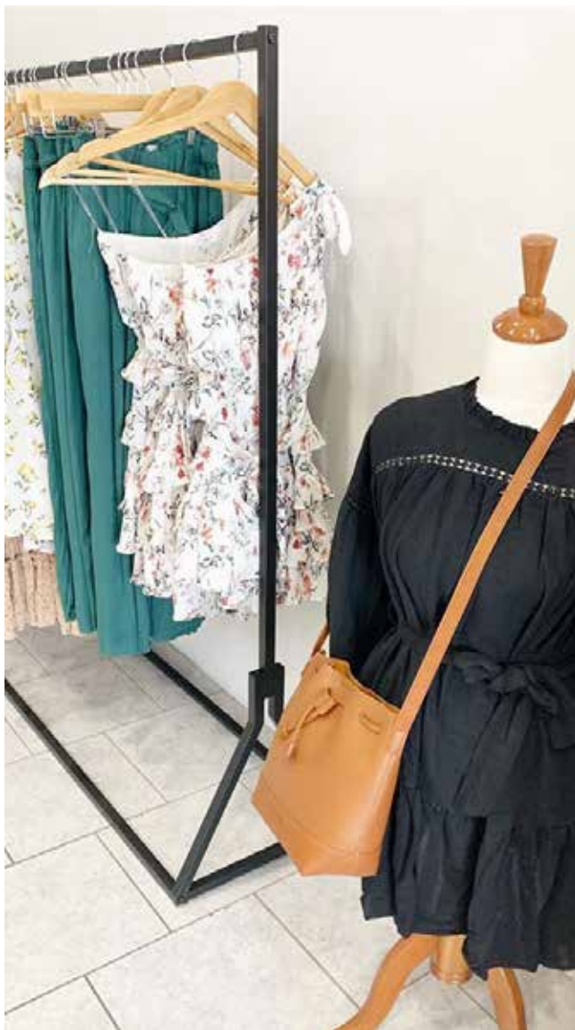
Freestanding Clothes Racks Industrial Style Single Rail Racks