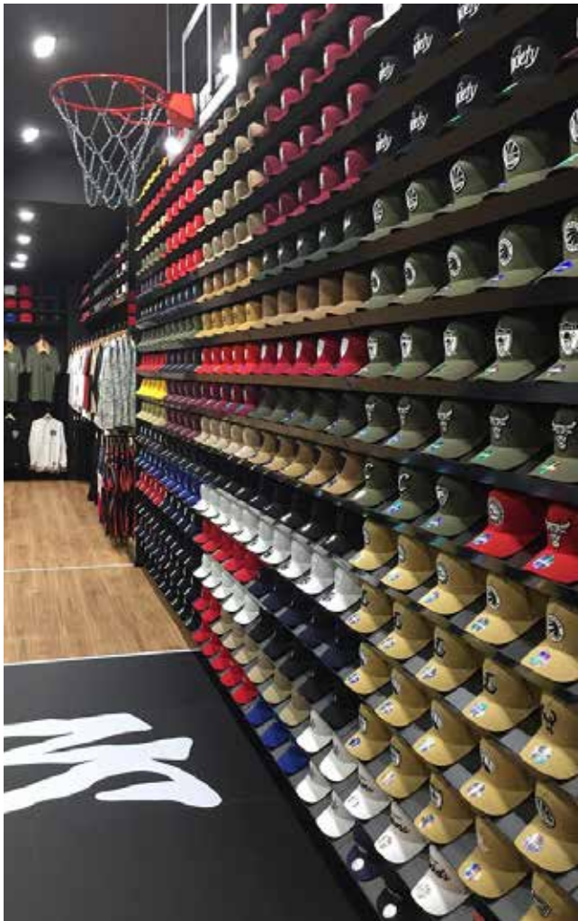
Multi-bay UniSlot™ Wallmount Wall mounted 600 and 1200mm bays, 2375mm and 3600mm high Accessorised with black MAXe sloping timber shelves, UniSlot™ crossbars, straight arms and sloping arms