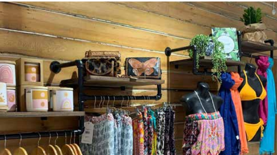
Rustic Wall Mounted Racks and Shelving Stepped Wallmount Pipe Rack with natural timber shelves